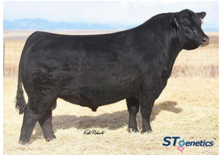
VAR Legend 5019

Legend is a balanced trait sire with impressive phenotype from a prominent cow family known for their performance and carcass quality. He consistently sires upper-level quality and marketability with standout thickness and capacity. Legend improves foot angle, while adding marbling, ribeye and phenotype.