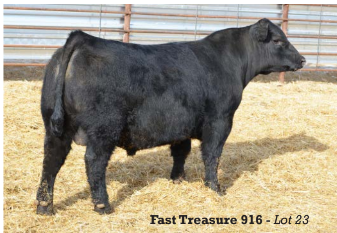
Fast Treasure 916 - Lot 23

Suitable for heifers or cows. A super correct bull with tons of muscle expression over his topline and down through his hindquarter. His first-calf dam weaned off a terrific prospect for calving ease, growth performance and carcass traits. CAB Qualified!