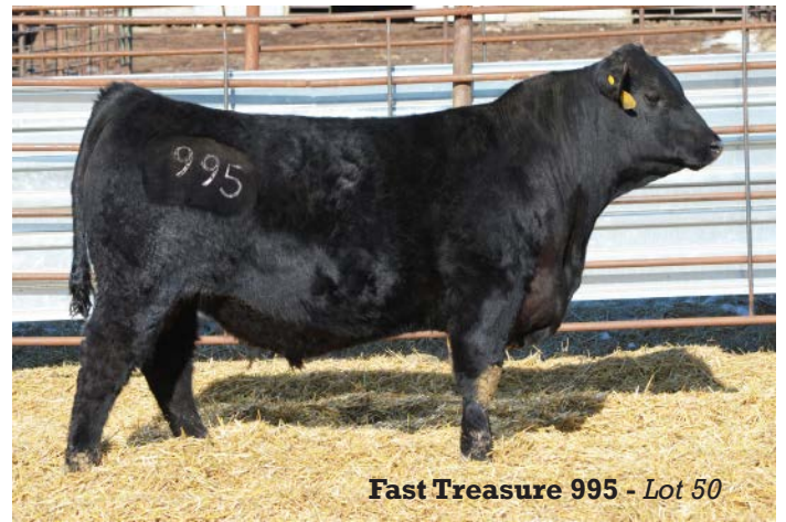
Fast Treasure 995 - Lot 50

Suitable for heifers or cows. A Treasure son with super muscle expression, length and depth of rib and loads of eye appeal! He ranks in the top 5% for WW and YW and posts a +.78 for Marb and +60 for $G which qualifies him for CAB. Dam's ratio: 5/101