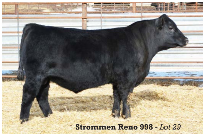
Strommen Reno 998 - Lot 29

Reno is one of the most sought after bulls in the Angus business for his genetic flawlessness and smooth look and this son should be considered one of his better ones for those traits. He has the style and pedigree to be a "Real" cow maker! The donor cow that 998 and 978 are out of had a string of bad luck but it didn't disprove her ability and power. I consider her to be a similar cow to the Erica ALT 24 cow with a bit more frame size and a weaning ratio of 3 @ 113. CAB Qualified