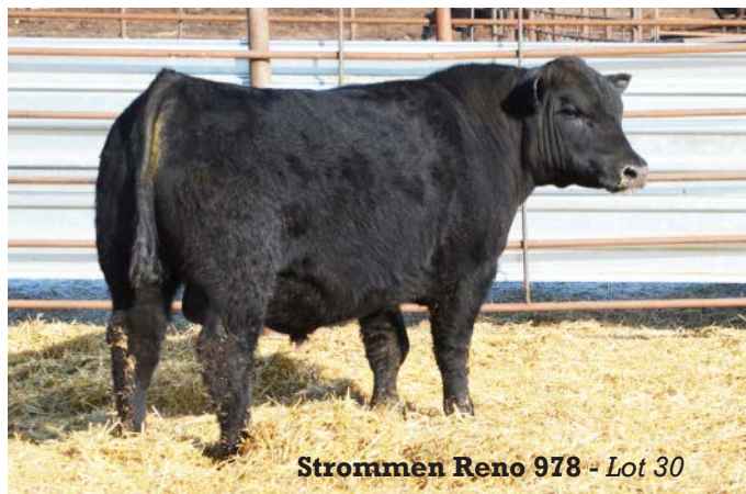
Strommen Reno 978 - Lot 30

A bit like his flush brother 998, but still presents a long bodied stylish look that'll produce beautiful females and pound producing bulls.