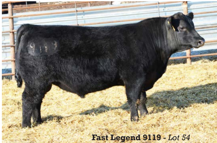
Fast Legend 9119 - Lot 54

This herd bull prospect is really nice. He's one you need to study a bit, but the more you look at him the more you'll like him. Out of the strongest cow family we have and the granddam is one of SCC's best cows and is a donor as well. Add in Greeley on the top for some real power and the broody 510 dam, and you have one of the hidden gems of the sale. Dam's Ratio: 3/98