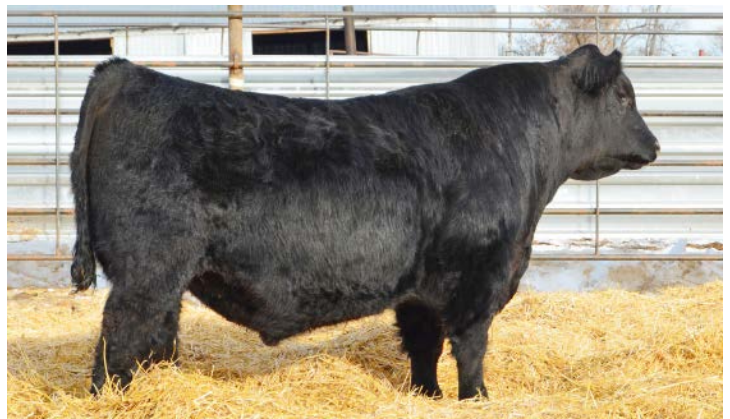
Strommen Resource 837 sold to Judeen Brusseau, Dickinson, ND, in our 2019 sale.

A stylish, attractive bull that is easy fleshing with heavy weaning performance. He ranks in the top 2% of the breed for WW and 1% for YW. He is a product of the highly maternal and productive Primrose Lady cow family. Dam's ratio: 7/103