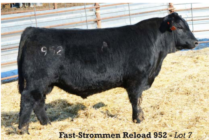
Fast-Strommen Reload 952 - Lot 7

This flush brother should be an ideal choice for use on heifers. A little more moderate framed bull than his brother, he still has the eye appeal, growth performance and structural soundness that his dam, Fast Blackbird T 264, consistently stamps in her progeny.