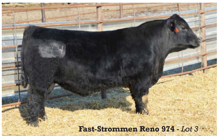
Fast-Strommen Reno 974 - Lot 3

Busy calving and can't make it to our sale? Buy with confidence online at www.Frontierlivesale.com!