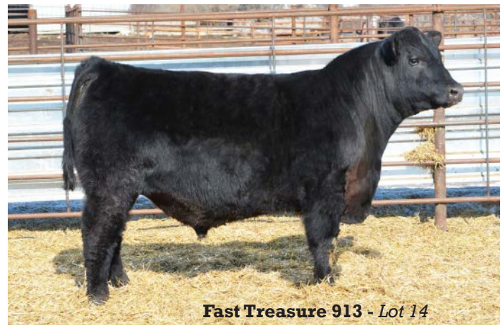
Fast Treasury 913 - Lot 14

Suitable for larger frame heifers or cows. A well made, structurally correct bull that has the ideal conformation for calving ease. This is his dam's first calf, a Capitalist 414 daughter with perfect udder and good maternal traits. He posts a +.77 for Marb and a +63 for $G which qualifies him for CAB.