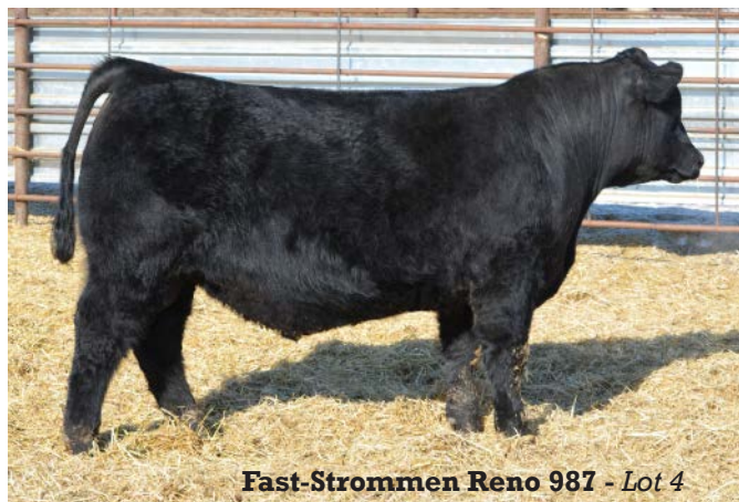
Fast-Strommen Reno 987 - Lot 4

Suitable for heifers or cows. Super attractive, well-balanced and long-bodied bull that combines the calving ease genetics of Spring Cove Reno and Erica 24's heavy weaning performance. He ranks in the top 1% of breed for $W and top 10% for $B. Really nice disposition and willing to let you scratch him. Retaining a 1/4 semen interest.