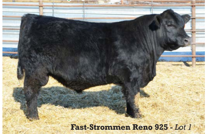
Fast-Strommen Reno 925 - Lot 1

#KM Broken Bow 002 Spring Cove Reno 4021 Spring Cove Liza 021 Soo Line Alternative 9127W #Fast Erica Alt 24 # Fast Erica Bdo 096 #Summitcrest Complete 1P55 #AAR Lady Kelton 5551 #C C A Emblazon 702 Spring Cove Liza 721 HF Kodiak 5R TLA Rosebud 4R Connealu 5175 240 Fast Erica NL 635