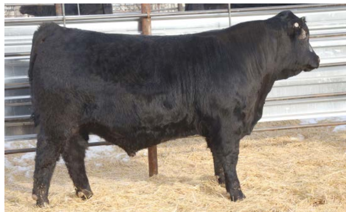
Fast-Strommen Payweight 846 sold to Dave Kraenzel, Hebron, in 2019 and is a maternal brother to Lots 1-5.

A structurally correct, larger framed bull with a long neck and smooth shoulders. His outstanding carcass EPDs qualify him for CAB. Dam's ratio: 6/99