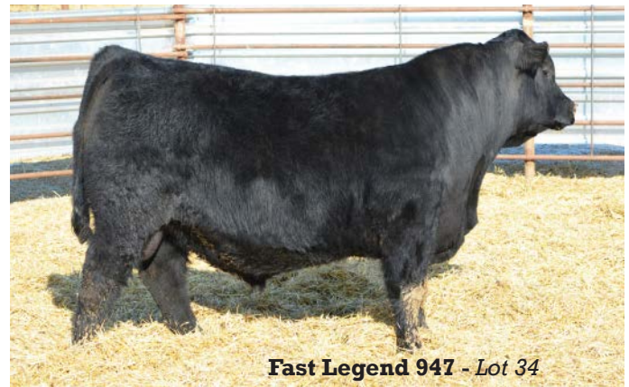
Fast Legend 947 - Lot 34

A meat wagon of a bull! One of the most eye appealing bulls in the sale! Super stylish with tremendous depth of rib and flank as well as the bull with the most natural muscle expression! His dam comes from our outstanding Blackbird cow family known for producing quality and performance. Dam's ratio: 5/104