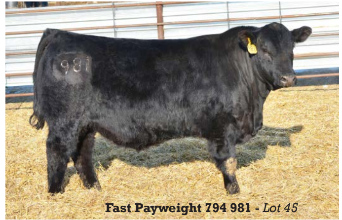
Fast Payweight 794 981 - Lot 45

Super attractive with loads of eye appeal, this bull is sure to catch your eye! His Pathfinder dam is the product of two generations of calving ease with Power Pro and Final Answer, while his home grown sire, Fast Payweight 1682 794, consistently sires moderate birth weights, quality and style. Dam's ratio: 3/05