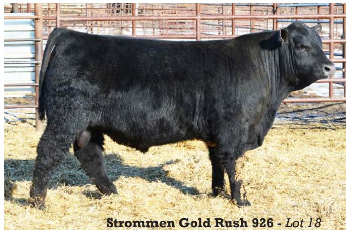
Strommen Gold Rush 926 - Lot 18

Gold Rush will be a strong addition to ANY herd! He comes not only with great look top to bottom but also ranks very high in his EPD profile. He sits among the elite with WW, YW, $W and $M all in the top 2% and 8 other traits in the top 10%!!! He has a really good foot and leg structure and has been a favorite among visitors. His dam was purchased as a heifer by SCC in our 2018 Bull sale!