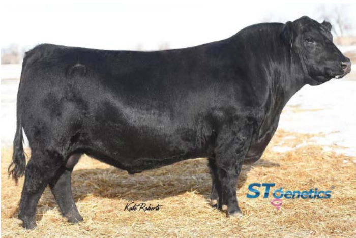
Sitz Reload 411C

Reload is a calving ease sire who combines a strong maternal pedigree, with conservative mature stature and weight, and achieves star status in the new Angus Maternal index and foot score EPDS. Reload is a mtternal brother to Sitz Logic with a strong maternal pedigree.