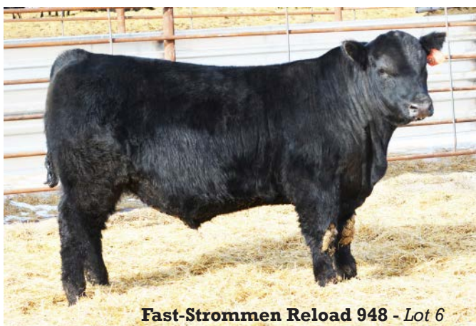
Fast-Strommen Reload 948 - Lot 6

Disregard this bull's actual birth weight as he is a product of embryo transfer. His high CED and low BW EPDs suggests that he has the genomics for calving ease. His well laid-in shoulders and long, smooth muscle pattern gives he a phenotype ideal for calving ease. Retaining a 1/4 semen interest.