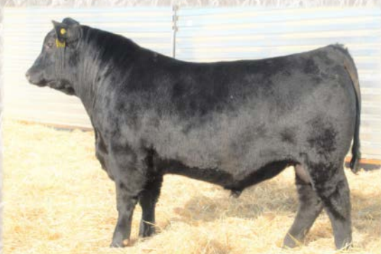
Top Selling Bull in our 2019 sale to Marlin Rambousek, Dickinson, ND. Maternal Brother to Lot 56.

Top 1% $W, Top 20% WW, YW Tremendous length of body, structurally sound, a standout! Dam and granddam have both produced sale toppers in 2018 & 2019. Actual WW 929 Dam is a Pathfinder Cow