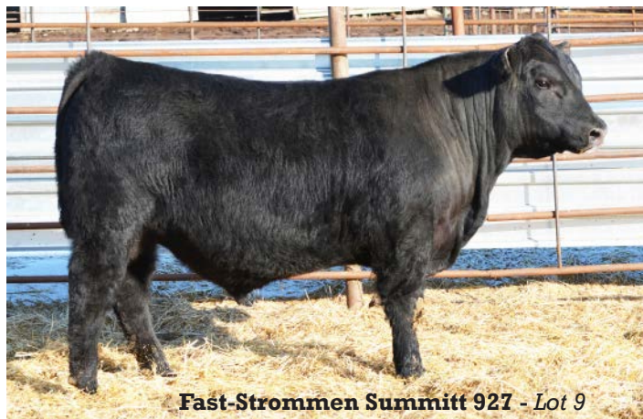
Fast-Strommen Summitt 927 - Lot 9

Like his flush brother, Lot 8, he is an easy to handle bull with a good disposition. A little more frame than his brothers, he also posts a higher WW and YW EPD. He is very correct in his structure and has the potential to improve any cow herd. Retaining a 1/4 semen interest.