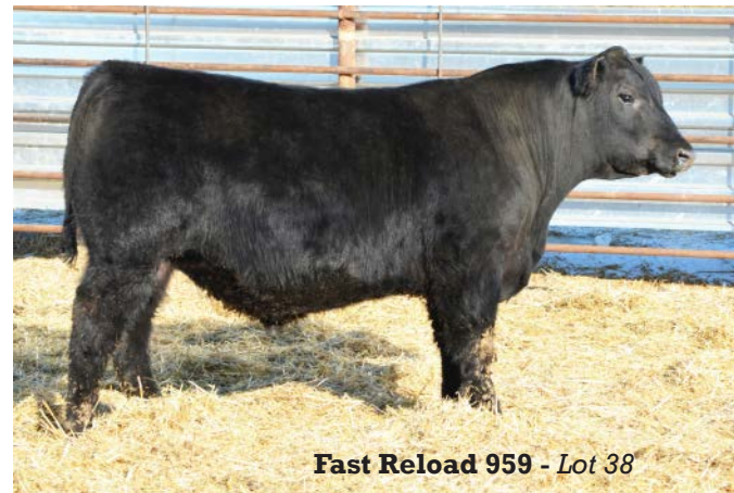
Fast Reload 959 - Lot 38

A thick topped bull with a well balanced phenotype and structurally correct feet and legs. His dam is a super deep, easy fleshing Resolute daughter. He ranks in the top 15% for $W, and top 10% for YW and $B. Dam's ratio: 2/103