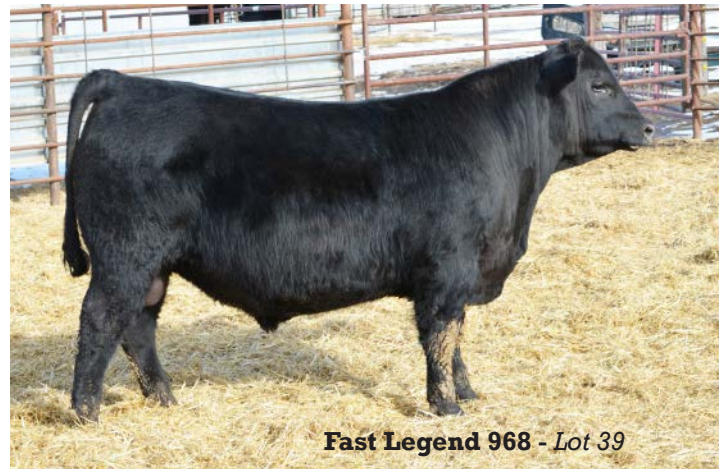
Fast Legend 968 - Lot 39

A tremendously deep-sided, rugged bull with a super wide top and good feet and legs. He ranks in the top 1% of the breed for WW, and YW, top 2% for $W and 3% for $B. His dam is a heavy milking cow from our great Matilda cow family that stays in excellent condition all year. Dam's Ratio: 5/104