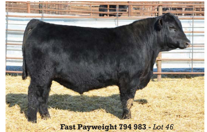
Fast Payweight 794 983 - Lot 46