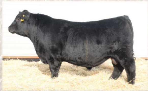
Second High Selling Bull in our 2019 sale Full Brother to Lot 57.