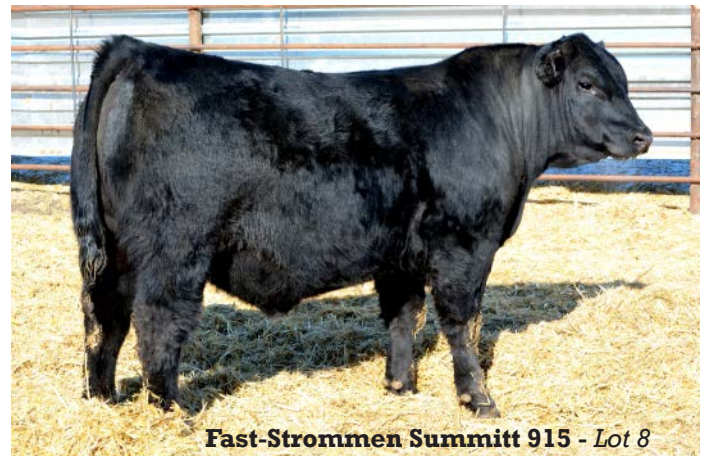
Fast-Strommen Summitt 915 - Lot 8

Suitable for heifers or cows. Again, disregard his BW as he is an ET calf. His CED and BW EPD put him well within the range of calving ease genetics. He is a super attractive bull with loads of muscle expression and a quiet disposition. He has the potential for extra maternal ability, you'll want to keep the heifers out of this one! Retaining a 1/4 semen interest.