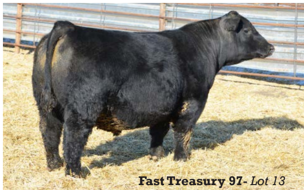
Fast Treasury 97- Lot 13

Treasury is a super powerhouse bull! He is nearly as wide as he is deep, with a wide base and a stout foot under each corner. His dam, a first-calf heifer, comes from a super maternal, high performance cow family. His grand dam is a Pathfinder cow and his great grand dam raised 17 natural calves of which were 5 sets of twins. His maternal cow family can trace their lineage directly from the first foundation cow owned by Jamie's grandpa, Simon Opp. Retaining a 1/4 semen interest.