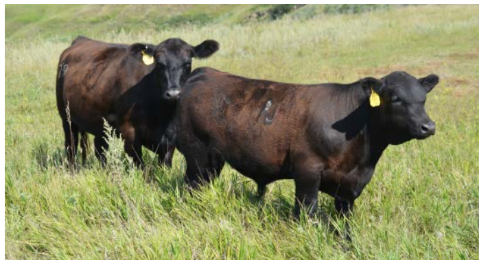
Fast Treasury 97, Lot 13, with his dam Fast Eloises Erica Com 730.

A rugged, rancher-type bull with explosive growth, exceptional length and depth of body as well as good muscle shape through his rump and rear quarter. His Alternative dam is a Pathfinder cow and always weans off a nice calf. His sire was purchased from Basin Angus Ranch, Joliet, MT. Dam's ratio: 6/108.