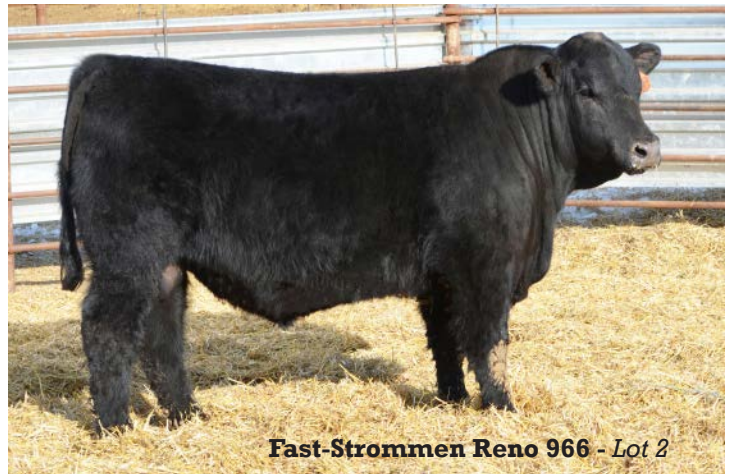
Fast-Strommen Reno 966 - Lot 2

His moderate birth genomics suggests that he could be used on larger framed heifers. Another good looking, long bodied, well made son of the great Fast Erica Alt 24 cow. He ranks in the top 1% of the breed for HP, $W, top 2% for WW, and 3% for YW. His carcass genomics also qualify him for CAB classification. Retaining a 1/4 semen interest.