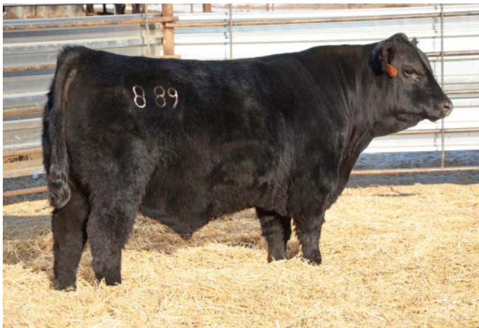
Fast-Strommen Payweight 889 sold to Jon and Julie DeKrey, Tappen, ND, in our 2019 sale and is a maternal brother to Lots 1-5.

A bull with tremendous muscle expression through his rump and over his top! Watch his video and see how he moves like a cat! Big and stout, he's a super prospect to add pounds to your calves! He ranks in the top 10% of the breed for WW and $B and top 4% for YW. His dam is a deep bodied, heavy milking Resolute daughter. Dam's ratio: 2/108