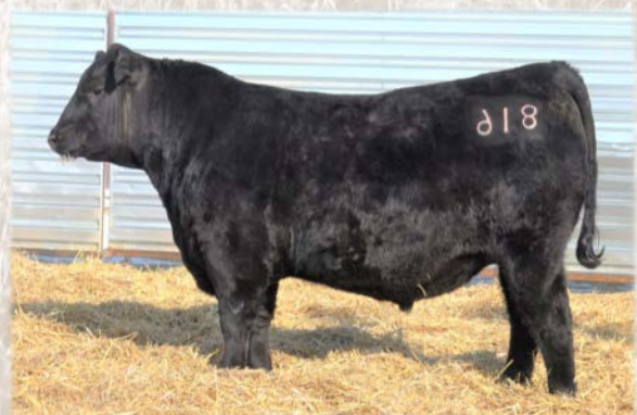
Pay Raise son that sold in our 2019 Sale

Long, smooth made Recommended for larger framed Heifers Actual WW 835