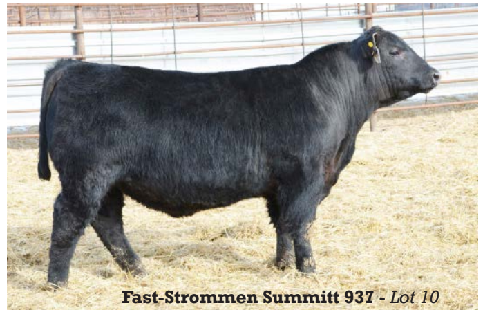
Fast-Strommen Summitt 937 - Lot 10

Suitable for heifers or cows. He is another really nice, moderate frame, long bodied, well balanced bull. His dam is a long, deep bodied cow with a sound, well-made udder. Once again, a maternally loaded herd bull prospect here!