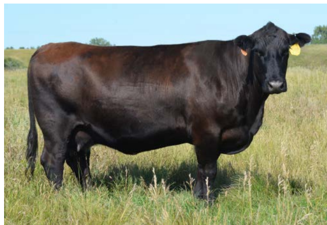
Fast Primrose GO131 340, Pathfinder dam of Lot 32.

Suitable for heifers or cows. A really deep bodied Treasure son with a long spine, good spring of rib and width through his rump. Another Treasure son that combines calving ease, weaning performance and quality carcass traits! His dam is sired by our home grown Fast Game On 131 and is a Pathfinder cow. Dam's ratio: 5/104