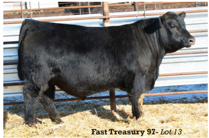
Fast Treasury 97- Lot 13